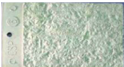
ICRI CSP 6